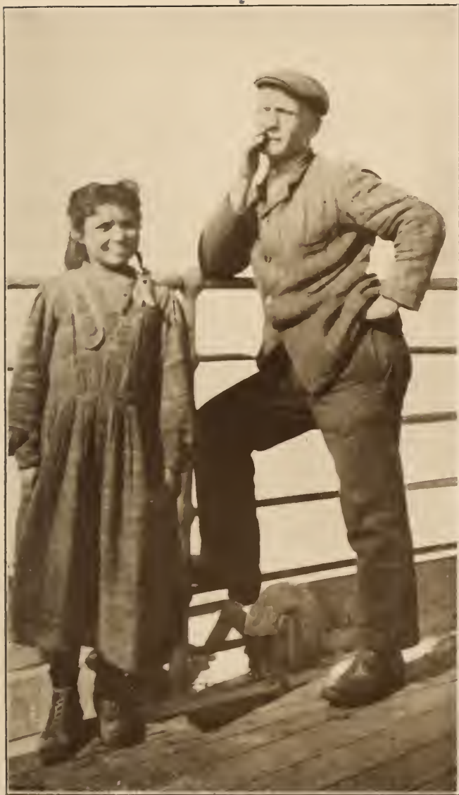
DIRTY MARY DURING THE PERIOD OF TRANSITION